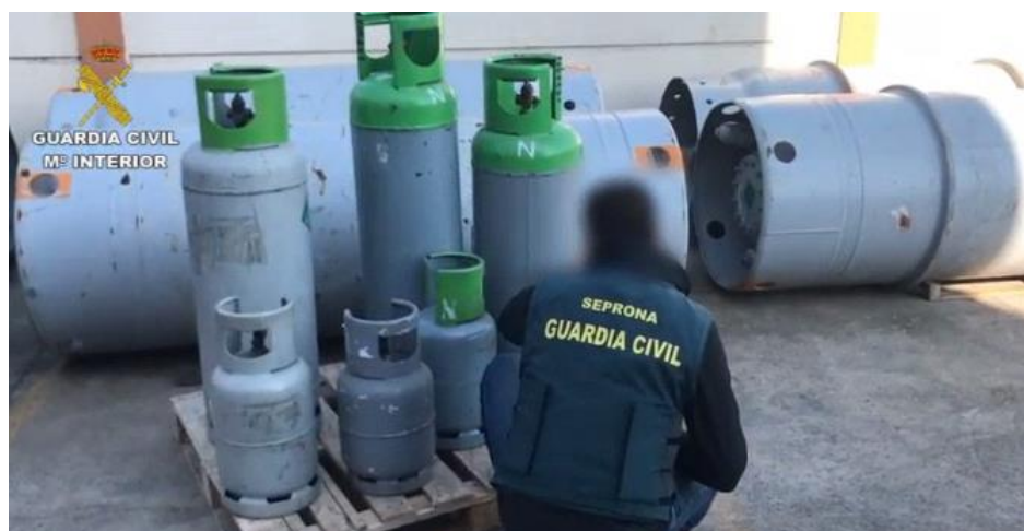
Figure 5. The R-22 gas seized during the action day of Operation Malvarma. A criminal network was using a company in Spain to smuggle ten tonnes of R-22 refrigerant gas without a legal licence to Panama, generating up to EUR 1 million in profit.

Since the entry into force of the EU F-Gas Regulation in 2015 x , the price of HFCs has started increasing as companies started stockpiling as a reaction to the uncertainty of future price fluctuations and market developments. The stockpiling led to a peak in prices in 2018 xi . EU manufacturers and users of HFCs have been prompted to make use of more climate-friendly alternatives and to respect an established quota system for bulk production and import of HFCs, which is progressively being phased down. The market scarcity created by the phasedown has further increased the price of HFCs, and the illegal trade of HFCs between producers, distributors and importers has thrived. Since 2018, tonnes of illegal HFCs have been increasingly seized in many EU MS.