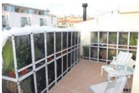
Figure 16. An illegal captivity breeding location discovered in the context of Operation Jungle V.