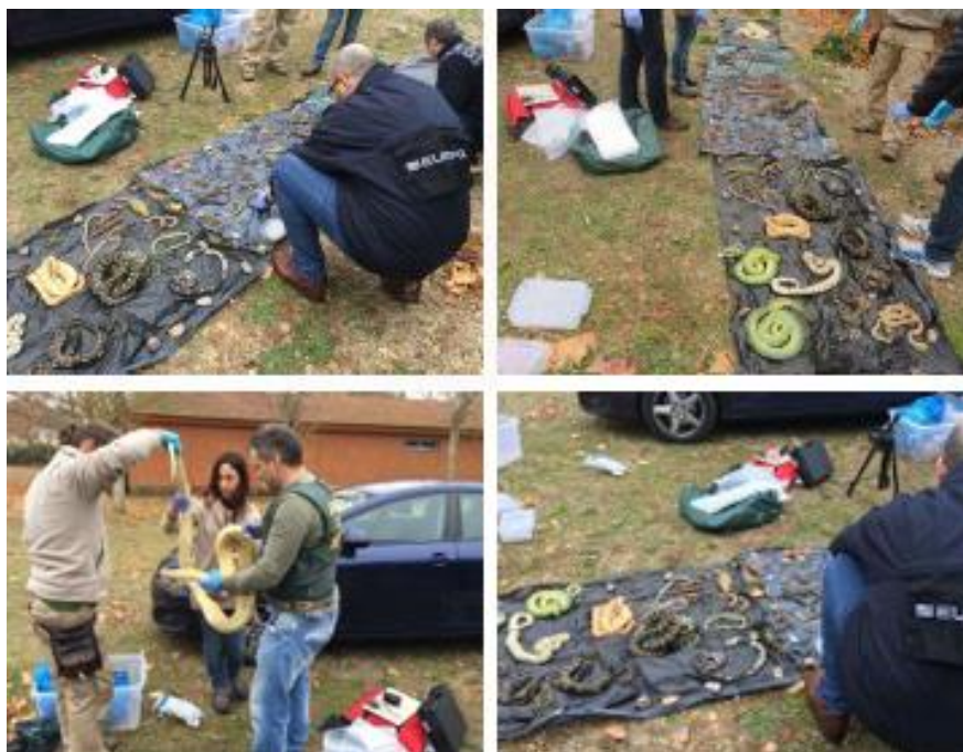
Figure 13. Snakes seized in the EU in the context of Operation Jungle V.