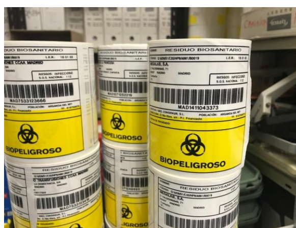
Figure 4. Toxic sanitary waste illegally stored and seized as part of Operation Retrovirus.