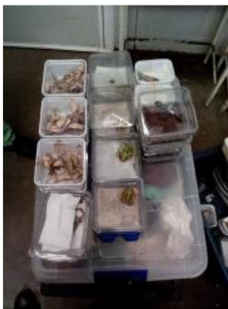
Figure 15. Live reptiles seized during the action day of Operation Jungle V.