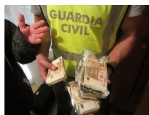
Figure 10. The cash seized during the action day of Operation Lake II.