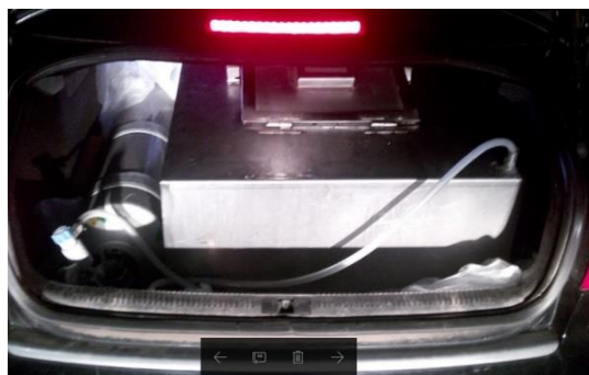
Figure 6. Vehicle trunk used for the transport of 15 kg of glass eels, discovered as part of Operation Lake II (ABAIA).

Chinese and European criminal networks cooperate at different stages of this illegal activity. In the majority of cases, European criminals organise poaching in the riverbanks of several Western European MS and the preparation of the transfer outside Europe, which is then taken over by the Chinese partners through trading companies. In some cases, poachers collect specimens from multiple countries and transfer significant amounts of glass eels (sometimes several tons) to aquaculture facilities in other MS, before dispatching them to Asia to conceal their real origins. Criminal networks use more often facilities in the Balkan region, eastern Europe, North Africa, and western Asia, as transit points for large quantities of eels before their transfer to Asia. In just one season, a European network could orchestrate the poaching and transfer to Asia of up to 5 tonnes of living glass eels, for a total profit of EUR 10 million. In China, the profit of the Chinese networks has been estimated at around EUR 50 million per year of activity. In another case, a criminal network was engaging with multiple Asian clients at the same time, in order to maximise profits during the high season of eel births.