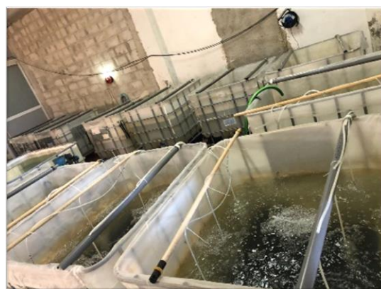
Figure 7. The EU aquaculture facility used before shipping the glass eels to Asia, discovered as part of Operation Lake II (ELVERS).