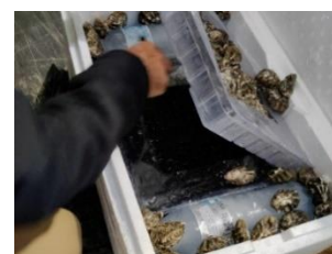
Figure 11. Eels concealed in a box of oysters as part of Operation Lake V.