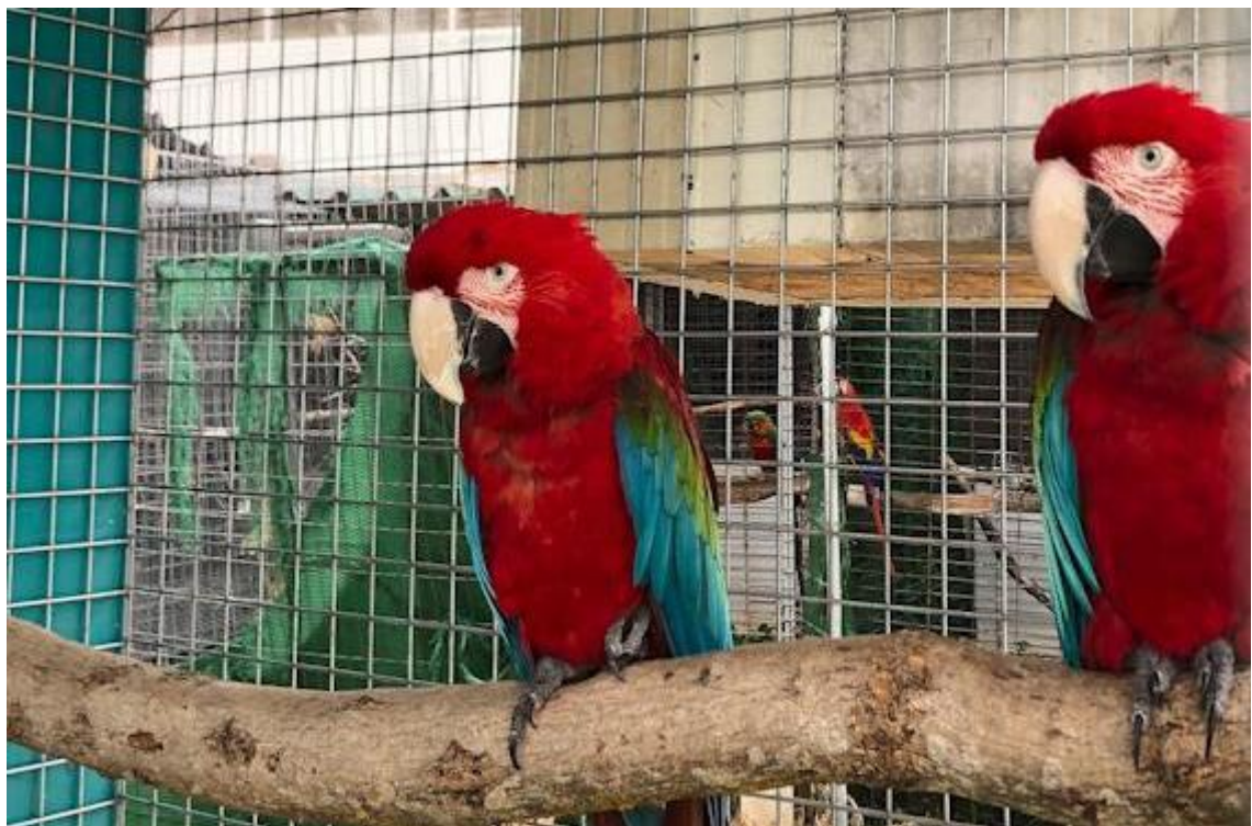
Figure 17. Parrots seized during the action day of Operation Citred.

Trafficking in birds and bird eggs is a very lucrative crime, requiring veterinary expertise and the use of sophisticated equipment. Some species can reach several hundreds of thousands of euros on the black market. The demand driving this illicit trade comes from collectors and breeders, but also from those who want birds as pets. Poachers in Central America for example, sell toucans for EUR 50 euro each to traffickers operating in Europe, who then sell them to final customers for up to EUR 7 000 per bird. Parrots are also targeted by EU criminal traders, with many species threatened by extinction partly due to illicit pet trade 37 .