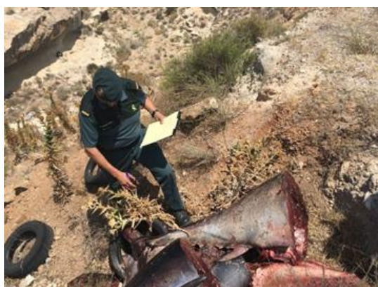
Figure 20. Bluefin tuna dumped on a field discovered during the action day of Operation Tarantelo.