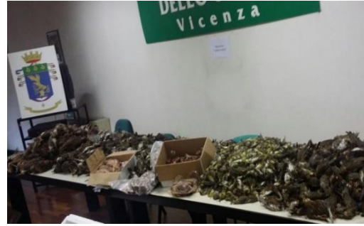
Figure 19. Dead specimens found during the action day of Operation Free Wildlife.

Document fraud is an integral part of the birds' trade across countries. Transporters use forged CITES documents, or declare the trade of different species, or that the specimens are bred in captivity and not caught in the wild. Shipping companies falsify consignee statements and couriers use fraudulent identity documents while travelling. Increasingly, criminal sellers attach counterfeit rings to birds' legs captured in the wild, to pretend that they come from legal breeders. Transporters also make large use of corruptive methods and bribes to pass border controls. At arrival, birds are caged in warehouses while waiting to be sold. In many instances, illegally traded birds are sold online, in pet shops as well as at national and international fairs, which confirms once again the systematic links between legal business structures and illegal bird trafficking. Some networks also sell dead specimens as food in restaurants or to food processing factories.