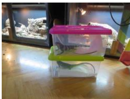
Figure 14. Live specimens sold illegally at a reptiles show, discovered in the context of Operation Jungle V.

The transport of reptiles is carried out by mules (many with European citizenship), who conceal the specimens inside suitcases or taped to their bodies, travelling by air on commercial flights (in some cases, live animals are even transported refrigerated). Criminal traders in the EU, occasionally operating in a crime-as-a-service mode, are responsible for the collection at arrival and further distribution to European and Asian markets, via trading and transport companies. Reptiles are also hidden among other goods. Export and import documents are usually forged or totally fabricated. Often, the specimens are labelled as non-CITES, the same documents for legal import of stock are used for illegal purposes and for the final sale (the so-called laundering of species). Traders, couriers and mules often also make use of fraudulent travel and identity documents and regularly bribe CITES and other controlling authorities. In the EU, criminal traders sell reptiles at animal fairs and shows, in regular pet shops and online. Retailers operate on dedicated online marketplaces as well as on social media and other websites. Reptiles are also traded on the dark web. Sometimes, buyers attempt the illegal breeding of trafficked species, with associated risks for the ecosystem, through the introduction of alien species.