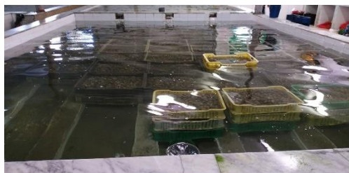
Figure 22. An illegal purification treatment facility discovered as part of Operation Txuspas.

areas (sometimes highly polluted), under the guidance of a coordinator, who is usually licenced for this practice. Once captured, the clams are stored in illicit aquaculture facilities and transferred, via land with private vans, to several intermediaries, who sell them to legal fishmongers, accompanied by fraudulent documents stating that they were harvested in permitted areas and underwent proper purification treatments. The lack of purification process poses serious health risks to consumers. In one reported case, a criminal network managed to cover the entire European fish market.