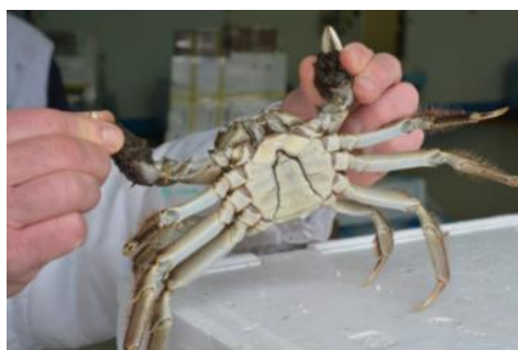
Figure 23. A specimen of Chinese crab seized during the operation in Italy, as part of Operation Krabs.

The introduction of live Chinese crab ( Eriocheir Sinensis ), also known as Wholandcrab, to EU markets, is illegal, as they are an invasive alien species causing severe damage to the endemic ecosystem. Several years ago, these crabs were brought into the EU from Asia, and nowadays they can be poached and exported outside the EU. However, they cannot be traded within the EU according to EU Regulation 1143/2014[1] on Invasive Alien Species 42 . Nevertheless, law enforcement in several MS are reporting the detection of Chinese crabs sold alive across the EU MS. Criminal networks of Asian origins located in the EU, with links to fishmongers and restaurants, traffic the specimens using trading and transport companies across various MS.