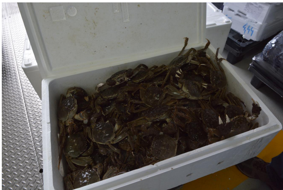
Figure 24. The Chinese crabs seized during Operation Krabs.