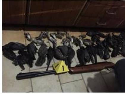
Figure 18. Dead specimens found during the action day of Operation Fennec.