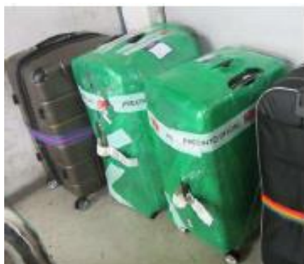
Figure 12. Suitcases used by mules for the transport of reptiles from America to the EU, in the context of Operation Jungle V.

Europe remains a key transit region and a final destination for trafficked reptiles originating from Africa, America and Oceania 36 . Reptiles are traded alive, dissected and/or as derivatives (i.e. reptile skins or skin products). The most common targeted specimens are iguanas, alligators, geckos, frogs, lizards, snakes, turtles and tortoises, which are sought by collectors, hobbyists, breeders and retailers as well as by individuals simply interested in owning reptiles as pets. The reptile trade is a lucrative business, since buyers around the world will pay significant amounts for unique reptiles. In one case involving the illicit trade of iguanas from Fiji, the value of the iguanas on the illegal EU market reached EUR 60 000 for one specimen. In many cases, criminals are legal operators (i.e. breeders, retailers or collectors), who have illegally extended their business to the trafficking of protected species. European criminals operate in connection with local poachers located in the countries of origin of the targeted species. In some cases, African countries are used as a transit point for wildlife originating from America. Specimens are stored there before arriving in Europe in order to divert attention from some of the more common trafficking routes.