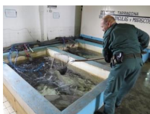
Figure 8. The EU aquaculture facility discovered as part of Operation Lake II.

Financial investigations have shown that criminal financial streams regarding eel trafficking connect Europe not only to Asia but also to other continents. In one case, a criminal network was using companies in Central America to launder the proceeds of the illegal trade of eels to Asia. EU traffickers use shell companies and bank accounts held by strawmen, informal payments, Hawala and false invoicing to distribute the criminal proceeds among associates. Laundering of profits occurs through trading companies and cash payments to mules, and profits are used for the purchase of plane tickets, equipment, transport rentals, logistics, etc. Laundering also occurs through the purchase of real estate and luxury goods, gold, and even through false loans. Asian criminal networks also use retail stores, restaurants located in Europe to launder the illicit proceeds of the trade of eels.