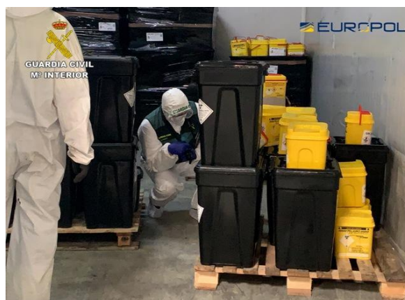
Figure 3. At the beginning of 2020, Europol launched operation Retrovirus to tackle unlawful healthcare waste management. Image shows containers of sanitary waste irregularly disposed of and seized as part of the operation.

The COVID-19 pandemic has increased the risks of criminal infiltration into the healthcare waste management business. Investigations carried out in several MS immediately following the outbreak of the pandemic in early 2020 have shown a series of criminal offences perpetrated around the disposal of the waste produced by healthcare institutions involved in the treatment of COVID-19 patients. The unlawful manipulation of potentially contagious sanitary waste could lead to severe health and environmental consequences.