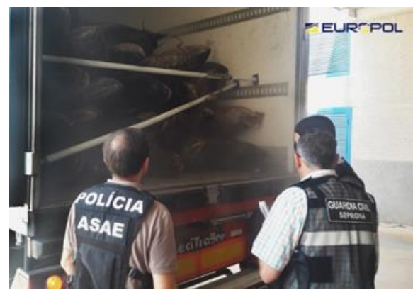
Figure 21. Bluefin tuna specimens illegally stored in a truck, discovered in the context of Operation Tarantelo.