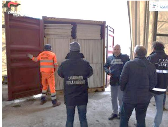
Figure 1. Seized solar panels loaded into a container as part of Operation Blacksun. The suspected companies were authorised to collect outdated solar panels from dismantled photovoltaic fields before transporting them to African and Asian countries to be illicitly disposed of.

companies, logistics businesses and intermediaries in transit and destination countries. With more solar panels reaching their end date, it is highly likely that illegal trafficking of outdated solar panels will increase in the near future.