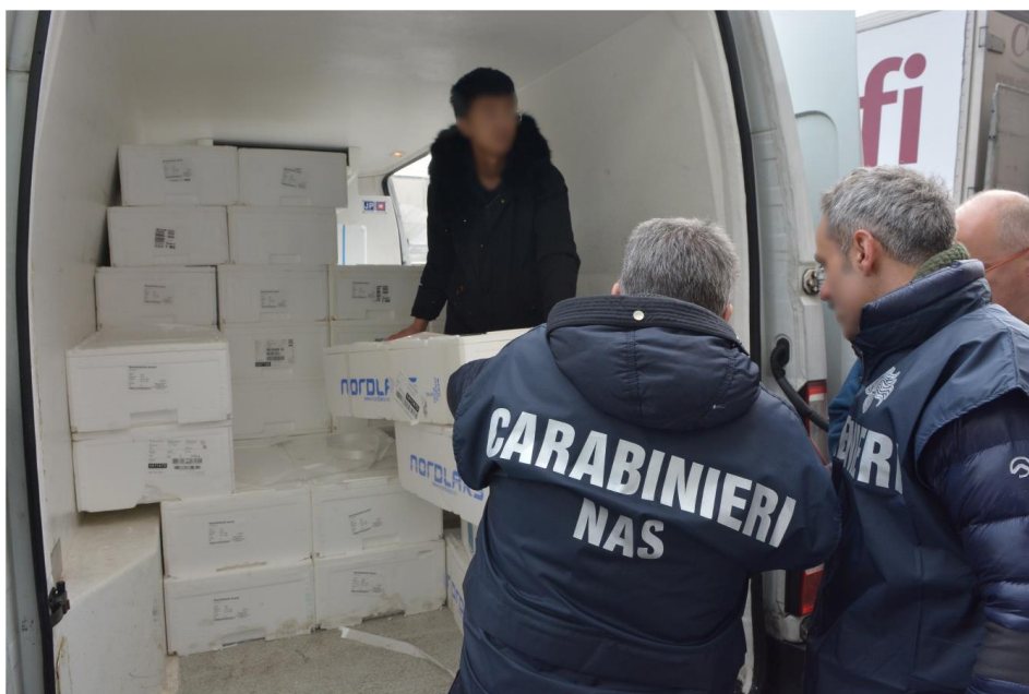
Figure 25. The seized van in which the Chinese crabs were transported.