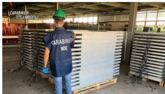
Figure 2. The seized solar panels stored in a warehouse as part of Operation Blacksun.